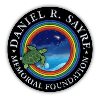
Helping Those Who Help All Of Us

Your contributions show just how committed our community is to helping one another. We are very thankful to have you among our ohana. ■