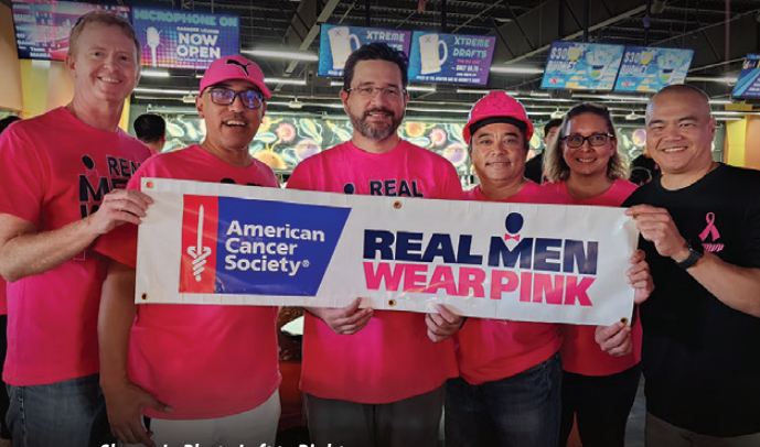
Shown In Photo Left to Right –