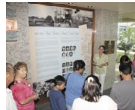
Guests stroll through the building's new entrance hall, looking at nine-foot display alcoves which recount the credit union's unique history.