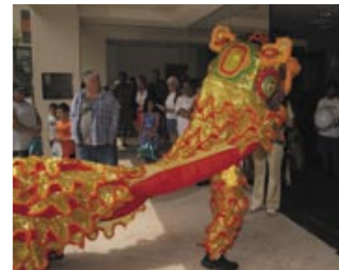
A traditional Chinese lion dance made a dramatic visit through the new building, mesmerizing staff, members and guests.