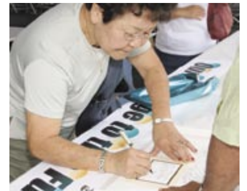
Members were asked to write a message for the future on a scroll, which was later placed in a 30-year time capsule.