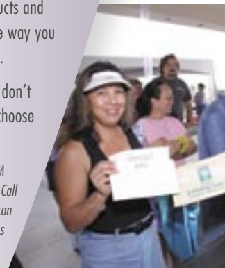
Everyone loves a door prize. A member happily displays the prize she won in a treasure chest giveaway.