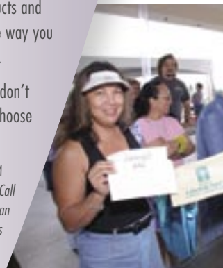
Everyone loves a door prize. A member happily displays the prize she won in a treasure chest giveaway.