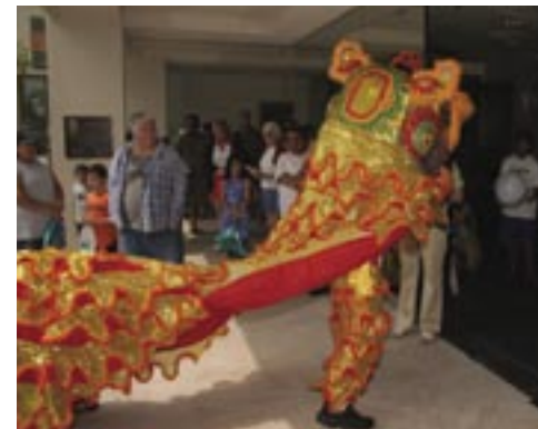
A traditional Chinese lion dance made a dramatic visit through the new building, mesmerizing staff, members and guests.