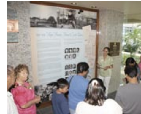
Guests stroll through the building's new entrance hall, looking at nine-foot display alcoves which recount the credit union's unique history.