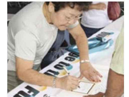
Members were asked to write a message for the future on a scroll, which was later placed in a 30-year time capsule.