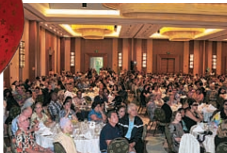
A sold out crowd enjoys the night's festivities.