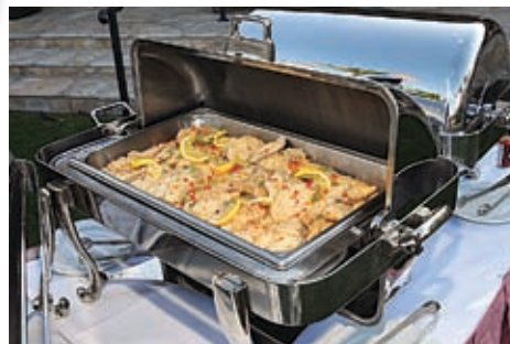
The buffet line with mouth-watering dishes.