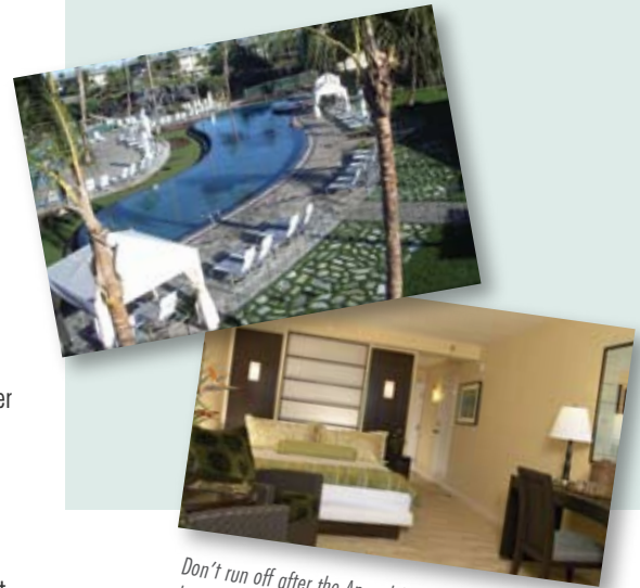
Don't run off after the Annual Meeting! Check into the hotel. Enjoy deluxe accommodations and world-class facilities at the Waikoloa Beach Marriott Resort and Spa.

If you are age 40-60, this site is for you. Plan It offers many interactive tools that give you practical and real-world ways to plan for retirement. Pre-Retiree Lane is an interactive neighborhood where you can meet your neighbors and learn about situations they encounter on their road to retirement, as well as vote in polls to see how you compare with others. Get information on topics including advice on growing your nest egg; tips to handle estate planning such as legal documents and wills; and guidance about managing spending and credit, budgeting, and debt. Click on the Plan It link on our Web site. We all have to retire someday, so get a head start and "Plan It" today!